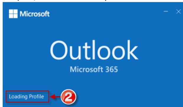
Figure 2: Loading Profile in Outlook