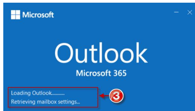
Figure 3: Retrieving Mailbox settings.